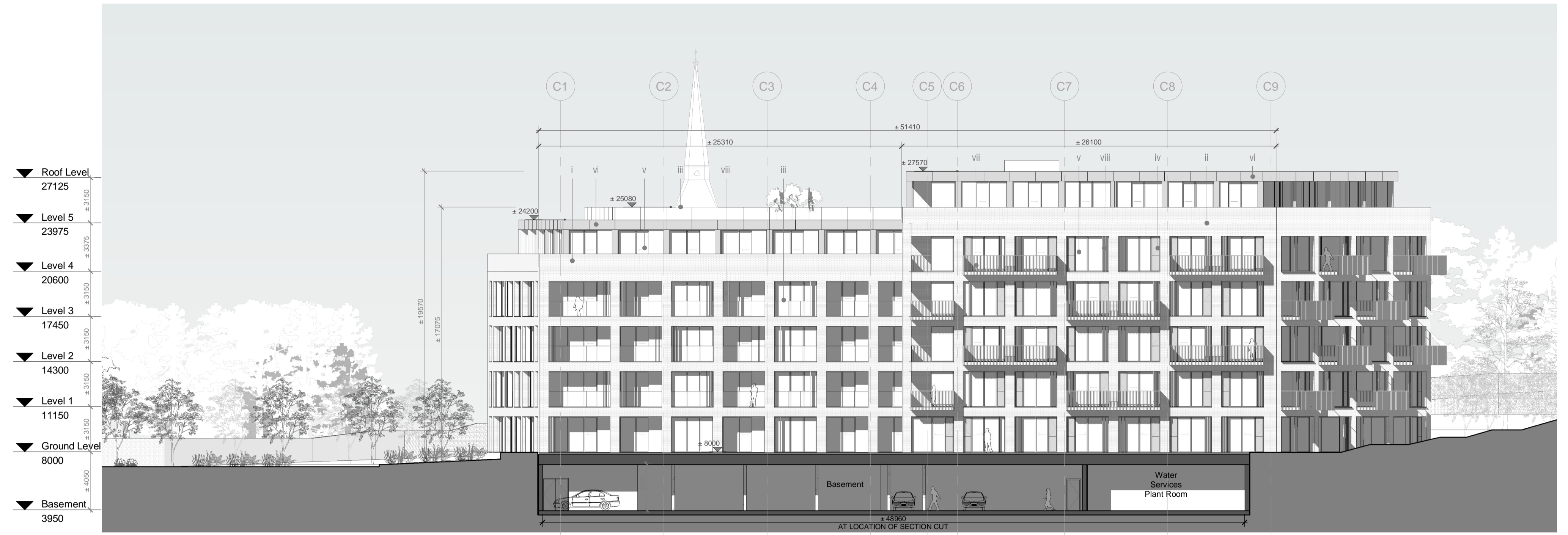
2 Building C - West Elevation scale 1 : 200