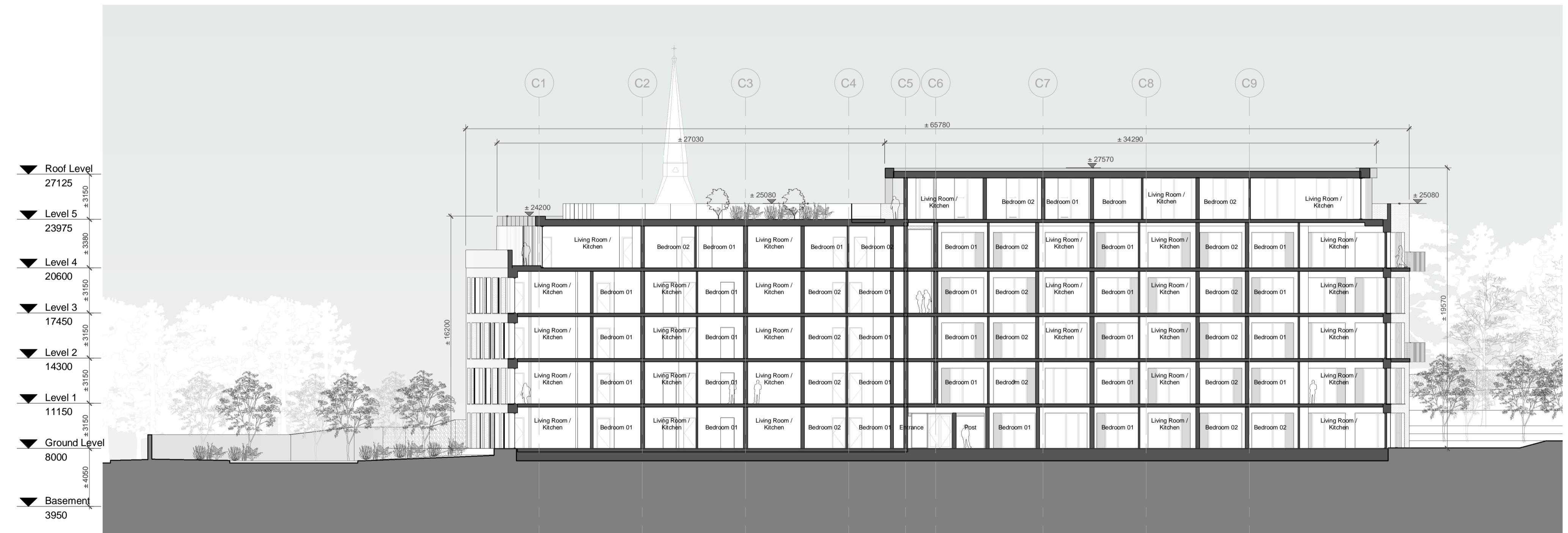
4 Building C - Section DD scale 1 : 200