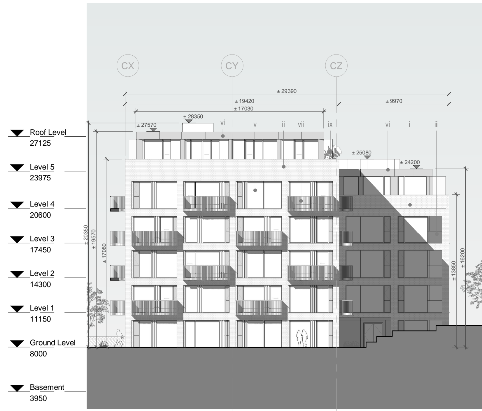
1 Building C - South Elevation scale 1 : 200