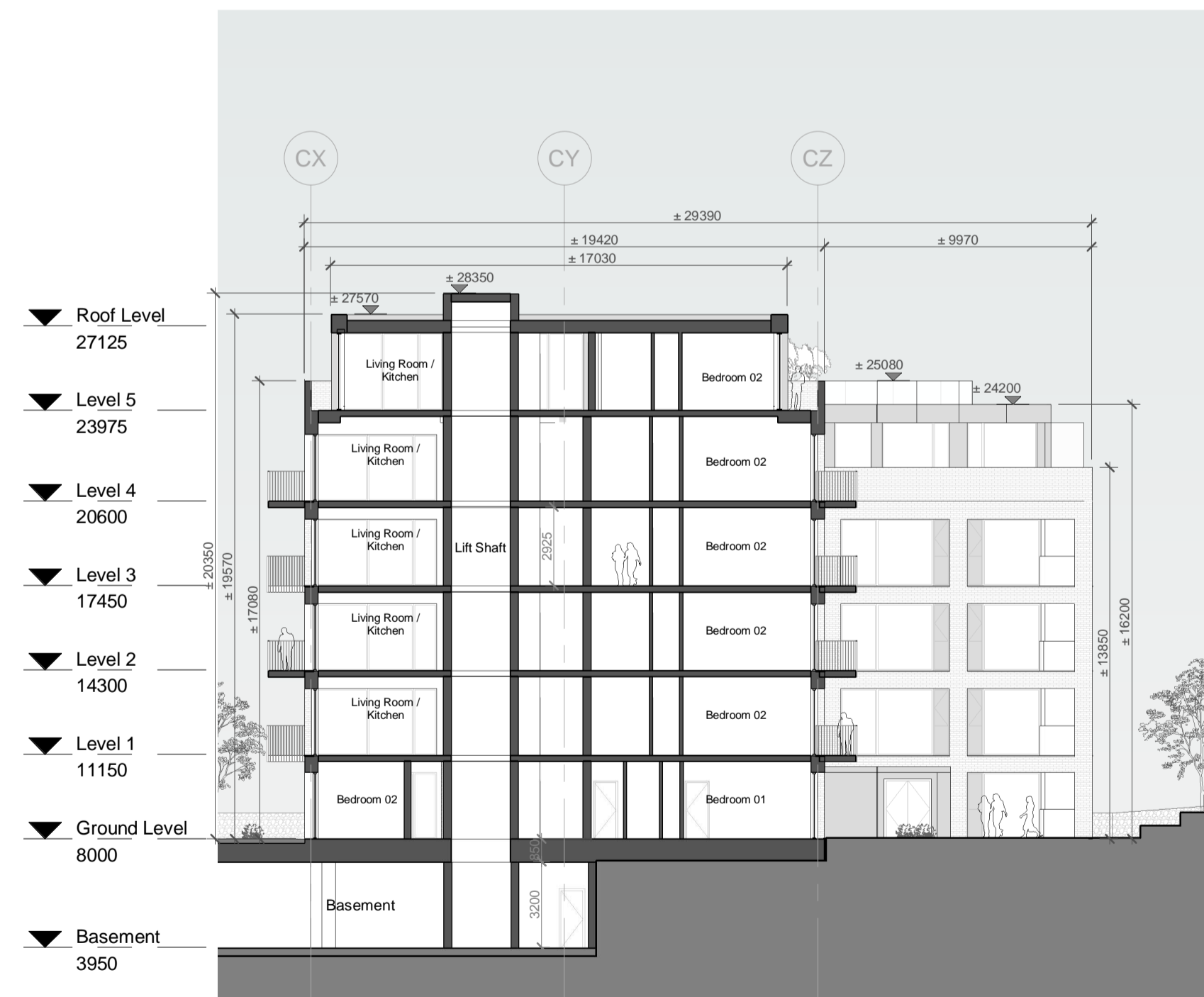
3 Building C - Section CC scale 1 : 200